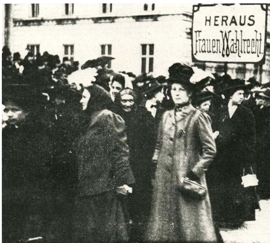
Women demonstrating in Vienna, Austria, 19 March, 1911

The next year, a million women in many locations demonstrated on various dates in February and March. After 1921 the date was fixed as 8 March.